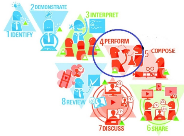
Fig. 1. Steps of the JuxtaLearn process

The whole learning pathway is orchestrated into eight stages (cf. Fig. 1 ) stages: (1) teacher identifies a subject, (2) teacher demonstrates a standard teaching activity (STA), (3) students interpret the STA in groups, (4) students perform and create a video, (5) students compose the final video, (6) students share the video, (7) students discuss the videos, (8) students review in the class. In this paper, we will focus on stage 4 (cf. Fig. 1 ) of the JuxtaLearn process.